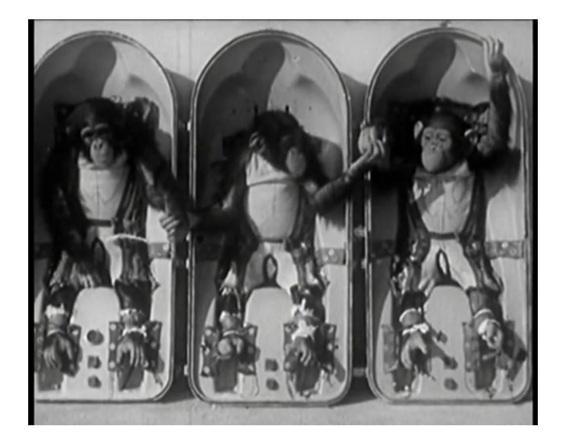
Imagen: Still from The Shell is Made of Steel

by Metatron Research Unit - http://nevada.ual.es:81/redURBS/BlogURBS/this-is-about-the-str uggle-for-life-artist-report-from-the-modern-illusions-exhibition/