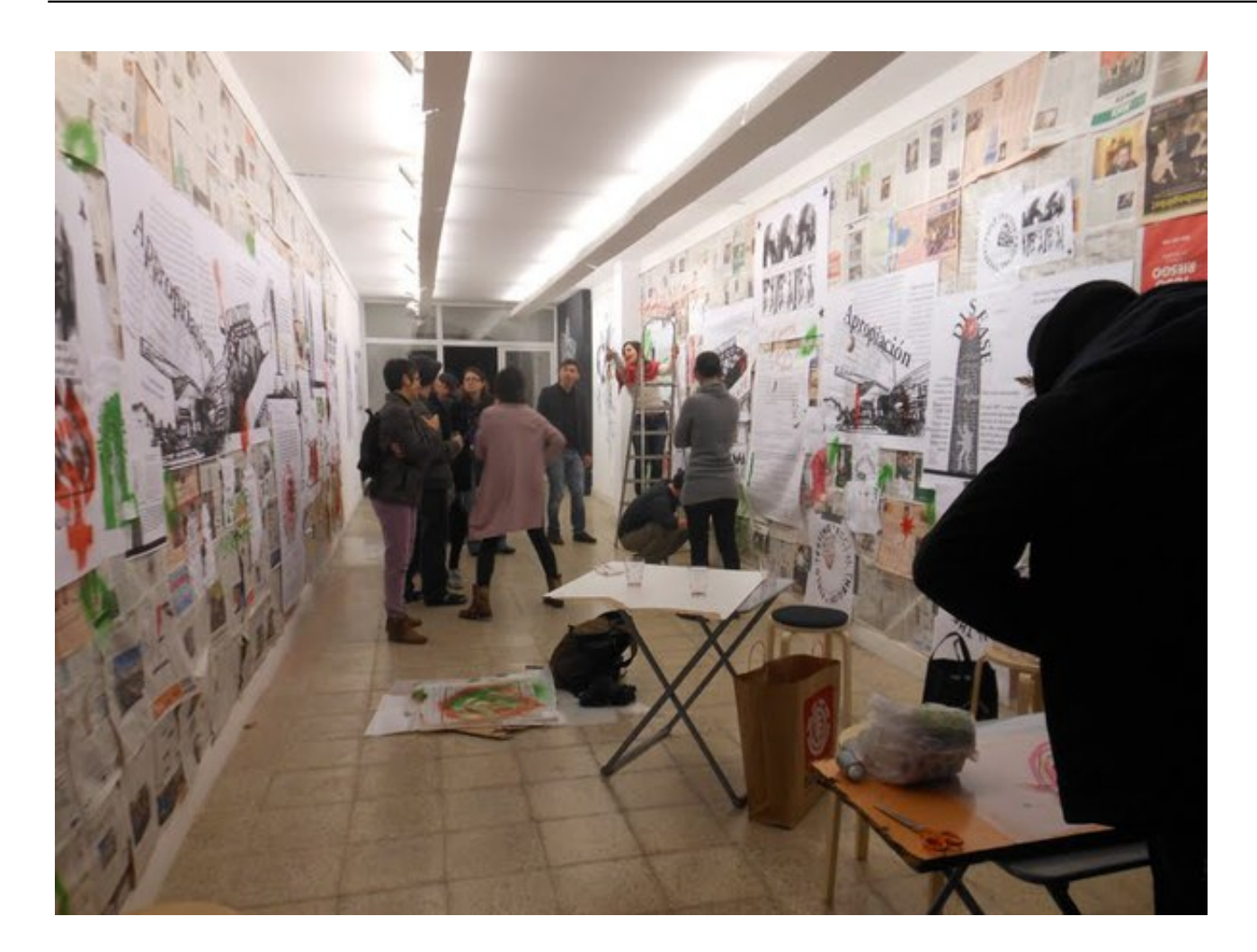
Imagen: Scene from the workshop

by Metatron Research Unit - http://nevada.ual.es:81/redURBS/BlogURBS/this-is-about-the-str uggle-for-life-artist-report-from-the-modern-illusions-exhibition/