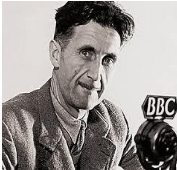
George Orwell fought against fascism during the Spanish Civil War

expression for the world-view and mental habits proper to the devotees of Ingsoc, but to make all other modes of thought impossible.