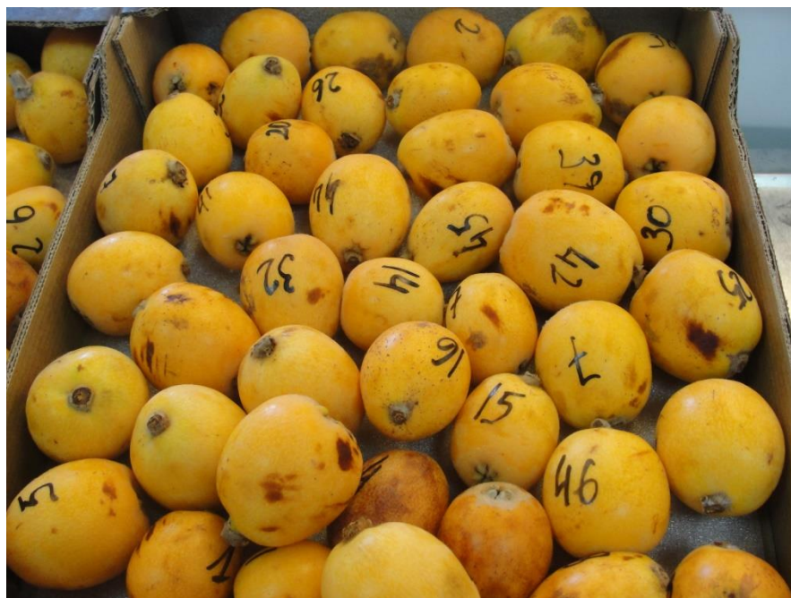
Figure 2. Tagged fruit undergoing handling performance evaluation in a packinghouse.

The acceptance of consumers was explored by sensory evaluations carried out by a panel formed by members of the University of Almería (Spain) of both genders and age between 25–55 years. Panelists were non-trained. Samples of 20 fruits per treatment were randomly offered to each panelist in a testing-controlled laboratory. External and internal fruit traits were judged by the panelists. External attributes were fruit size, skin color, damages (evaluated by visual defects) and firmness in fingers. Internal attributes were sweetness, acidity, juiciness and hardness in the mouth. In addition, an overall evaluation of external and internal parameters of the samples of each treatment was performed by the panelists and expressed as global acceptance. Each fruit attribute was ranked on a hedonic scale from 1 to 5 (Table 2) as previously described [18]. Each panelist used the whole sample for visual evaluation while 2–3 representative fruits from the sample were used for flavor and texture evaluations.