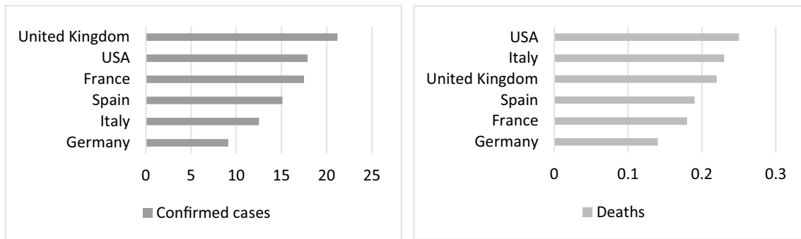
Fig. 1 Confirmed cases and deaths per 100 population.

hand, [20] suggest that income inequality by county in the United States positively impacts COVID-19 incidence and mortality rates. At a more general level, [21] reach the same conclusion, i.e., in the case of OECD countries, greater income inequality is associated with higher COVID-19 mortality for the four age groups they establish. Thus, income inequality is an indicator that incorporates a series of elements of socioeconomic disadvantage that can have an impact on higher incidence and mortality rates of the virus. These include precarious housing, smoking, obesity and pollution [22].