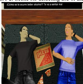
Figure 2. Scene for detecting use of alcohol

Face animations were developed focusing on the character's face in more detail to increase expression and realism of the body animations. So if one character is threatening another in a given scene, his face expresses aggressiveness, or if on the contrary, a character feels threatened, his face shows fear. To accomplish this level of expression in the characters' faces, the number of polygons and level of detail increases noticeably in eyes and lips, the zones most affected (Figure 2).