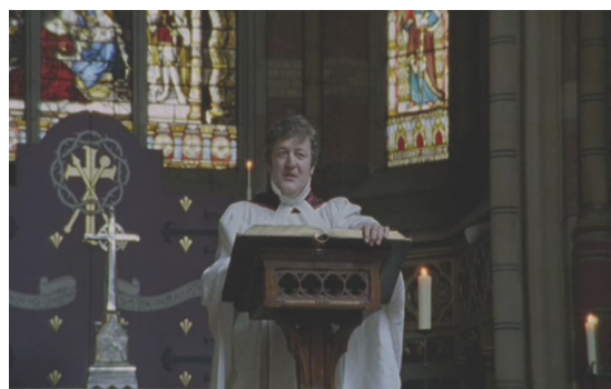
Illustration 12. Holding his hand on the open Bible. Time 24:48.