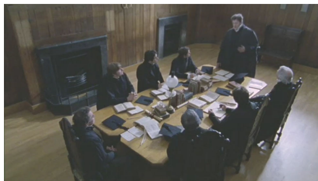
Illustration 15. The doctor speaks in front of the tutors. Time 12:57.

Also, the principles of Arnold's pedagogical reform are staged when he convincingly argues his ideal to the group of teachers: «All the boys will have considerable responsibilities but they will be taught in pastoral care and Christian love, not in an atmosphere where only the strongest and the cruellest survive» (illustration 15). Moreover, Dr Arnold is described as a human being able to make mistakes, feel bemused by the chaos and even sometimes nearly overwhelmed by the circumstances. Having all these features considered, Dr Arnold apparently defends the weak against the strong with a great effort and instils love and sympathy among the schoolboys.