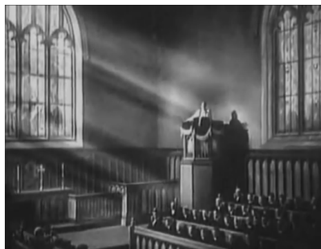
Illustration 7. Long shot indoors. Time 9:12-9:19.

Beginnings and endings determine the structure of such literary pieces and this is not an exception. After a condensed speech full of great prospects for the future, spectators face a humoristic sketch when tutors are leaving the hall. «I'll give him a year, ... six months» (illustration 8). Here the director seeks complicity with the audience. Instead of a large argument, the tutors act naturally disapproving the headmaster's view. «Moral principles, what's the school going to do with moral principles? Feeding one end, beating the other. That's education» (illustration 9). This ending shows the other side of the coin, the opposite side that Dr Arnold has to fight against. Good and evil have been introduced and the mission is on the way to being accomplished. To summarise, this scene adaptation provides an easy reading for American audience because of the familiar Puritan setting and the similarity with the Manifest of Destiny.