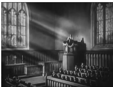
Illustration 2. Beginning of Dr Arnold's sermon. Time 7:24-7:28.

As portrayed in «the oak pulpit standing out by itself above the School seats» (HUGHES, 1857: 141), Dr Arnold is standing over the schoolboys' heads. Light falling from his right side is used to enhance the whole pulpit and consequently several shades of grey appear (illustration 2). The stream of light is especially reflected against Arnold's figure with maximum brightness to give meaning to Hughes' description when he wrote that Arnold stood there with his spirit full of «righteousness and love and glory» (HUGHES, 1857: 141). That light effect darkens the remaining parts of the scene significantly highlighting the focus of attention: Dr Arnold in his sermon. Likely, this technique attempts the display of the divine light to capture the meaning visually. While the mischievous schoolboys sit in darkness, Dr Arnold stays on the right side with light. Given that the ray of light is directly sent to Dr Arnold, the audience can see his shadow so that Arnold's projection is three-dimensional 22 . When spectators hear the word 'corrupted' (illustration 3), there is a close-up on Dr Arnold dressed in white to reflect the light His sight inspires solemnity and respectfulness and his voice is loud and clear 23 .