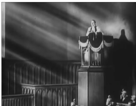
Illustration 6. The gleam of light intensifies Dr Arnold. Time 8:40-8:48.

be that this setting matches with the austerity of the Puritan church 26 . Needless to say there are evident similarities between the Manifest of Destiny and Dr Arnold's speech 27 . These schoolboys are the chosen ones to begin a new generation that will change the face of education of England as Dr Arnold's character says.