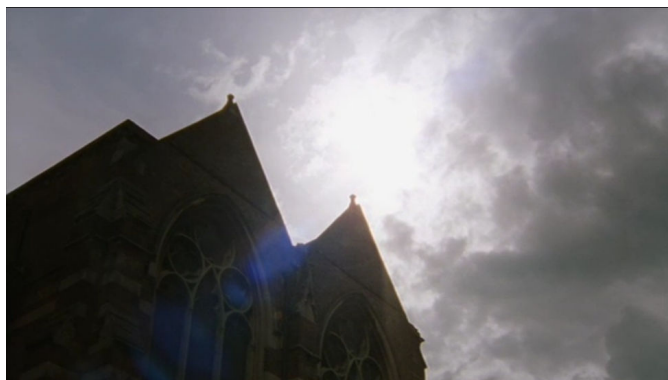
Illustration 10. Exterior shot of the chapel. Time 24:01.

This indoor setting has nothing to do with the simple outlook in Stevenson's film adaptation. The abundance of luxuries is widely displayed around the chapel. For example, some large painted windows, many golden decorations on the wall and two large crosses: one in silver and the other one in gold. From all this it can be easily interpreted that these schoolboys belong to wealthy families, and consequently, to a particular social class 28 . This time Dr Arnold is performing in a closer position rather than in a top pulpit when he says «A place of light and learning and goodness» (illustration 11). In contrast, he is preaching with his right hand lying on an open bible (illustration 12).