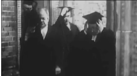
Illustration 8. Tutors leaving the chapel. Time 9:19-9:24.