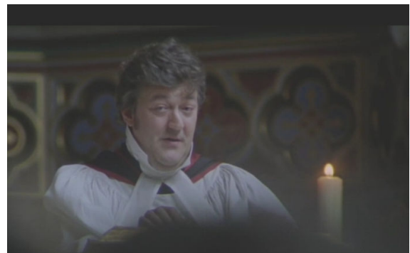
Illustration 14. A teaching lesson. Time 25:28.

Also, the principles of Arnold's pedagogical reform are staged when he convincingly argues his ideal to the group of teachers: «All the boys will have considerable responsibilities but they will be taught in pastoral care and Christian love, not in an atmosphere where only the strongest and the cruellest survive» (illustration 15). Moreover, Dr Arnold is described as a human being able to make mistakes, feel bemused by the chaos and even sometimes nearly overwhelmed by the circumstances. Having all these features considered, Dr Arnold apparently defends the weak against the strong with a great effort and instils love and sympathy among the schoolboys.