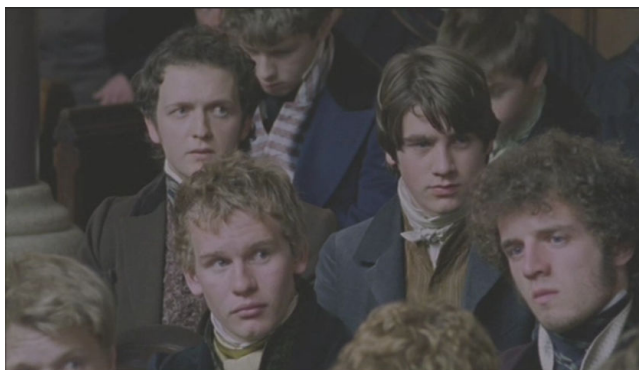
Illustration 16. Creating bonds of communication. Time 24:51.

Likewise, the figure of Dr Arnold stands for a fraternal authority who would carry out justice to everyone without caring who the father of the student is. The Doctor, henceforth, takes a real active role, every time he appears to warn or punish the bully. To perform this point, Dr Arnold's image results in a symbolic father by establishing a relationship of confidence, as expressed in «I will believe each boy's word as I will believe a man's word» (illustration 16). To some extent, this sentence strengthens bonds of communication between the schoolboy and the headmaster, but this is a double-edged sword with its downsides. Since the youngsters are going to be men, they will be treated like them.