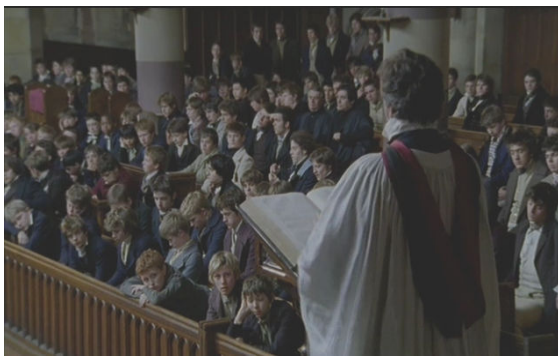
Illustration 13. Schoolboys in the sermon. Time 24:14.