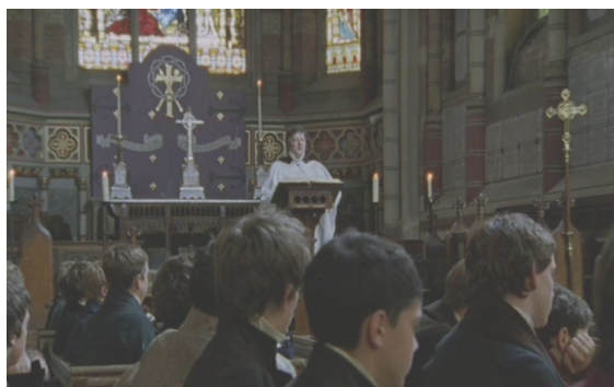
Illustration 11. Interior shot of the chapel. Time 24:03.

This indoor setting has nothing to do with the simple outlook in Stevenson's film adaptation. The abundance of luxuries is widely displayed around the chapel. For example, some large painted windows, many golden decorations on the wall and two large crosses: one in silver and the other one in gold. From all this it can be easily interpreted that these schoolboys belong to wealthy families, and consequently, to a particular social class 28 . This time Dr Arnold is performing in a closer position rather than in a top pulpit when he says «A place of light and learning and goodness» (illustration 11). In contrast, he is preaching with his right hand lying on an open bible (illustration 12).