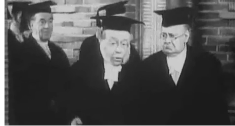
Illustration 9. Tutors disapproving the headmaster. Time 9:24-9:31.