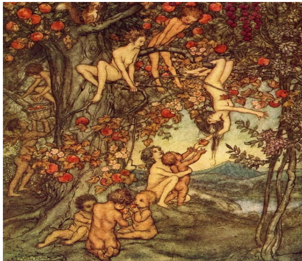
The paradise of children. Drawing by Arthur Rackham (1922)

As both myths have many elements in common, we will start with the characters used by Hawthorne. The only names that he keeps are those of Epimetheus and Pandora among all the characters that Hesiod mentioned in Theogony and Works and Days . They are the only characters that make up this story. We can see that, characters such as Zeus or Prometheus and even the other deities that Hesiod used in his poems to describe the creation of the first woman, Pandora, are not mentioned here and in fact, only Hermes appears as Quicksilver . When Pandora asks Epimetheus about the person who could have brought the box, he answers her: “ It was like two serpents twisting around a stick, and was carved so naturally that I, at first, thought the serpents were alive. ” (Hawthorne 1851: 4). This is a clear reference to Hermes' most famous prop: his caduceus or kerykeion , i.e., a magic stick with two snakes twisting around it. The only role of Hermes here is that of being the messenger of the box.