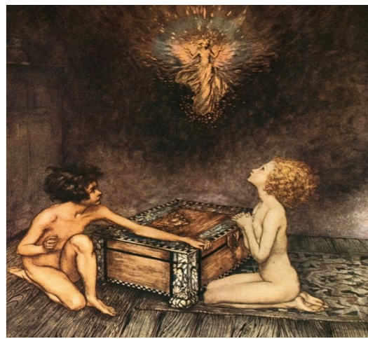
The figure of hope. Drawing by Arthur Rackham (1922)

Once Pandora has opened the box for the first time, she notices that there is something still remaining inside of it and Hope encourages her to open it once again and let it out. She tries to convince her that she is doing the right thing by saying: “Come, my dear Pandora, lift up the lid. I am in a great hurry to comfort you. Only let me have some fresh air, and you shall soon see that matters are not quite so dismal as you think them!” (Hawthorne 1851: 10). This entity, already inside the box, insists on the idea that Hope is good and has come to the world to stay and help them: