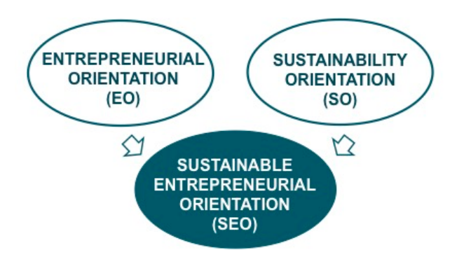
Figure 1. Graphic representation of SEO construct configuration.

Other studies that propose the construction of multiple strategic orientations are those by Covin and Miller [15], Mitchell [62], Zhou [81] and Frishammar and Andersson [116]. On the one hand, Mitchell [62] considers the creation of a sustainable market orientation as the integration of market orientation and sustainable development. As is asserted in our work, multiple strategic orientation configuration results from the combination of two constructs, EO and SO. On the other hand, Covin and Miller [15], Zhou [81] and Frishammar and Andersson [116] measure international entrepreneurial orientation as the relationship between EO and a dependent variable related to international performance. Contrary to these authors, in this paper SEO is not considered only as an organizational result but also as an important part of organizational culture reflected in business philosophy—both EO and SO are defined as organizational culture traits [84,111–113]. Thus, SEO performance outputs should be measured with a dependent variable which consider results at an economic, social and environmental level.